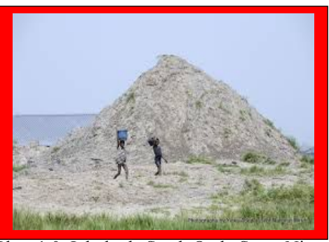
Plate 1.0: Igbokoda Sand, Ondo State, Nigeria.

Soil sample was obtained at Igbokoda area of Ondo State (Plate 1.0). The sample was collected at about 0.3m depth at two different locations within the same axis.