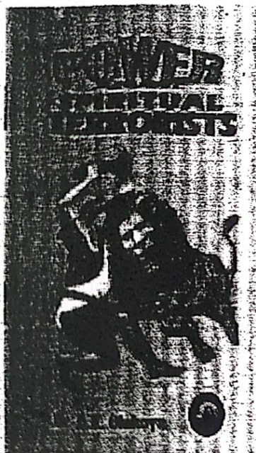
Figure 4: Power Against Spiritual Terrorists