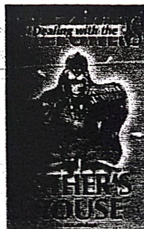
Figure 7: Dealing With the Evil Powers