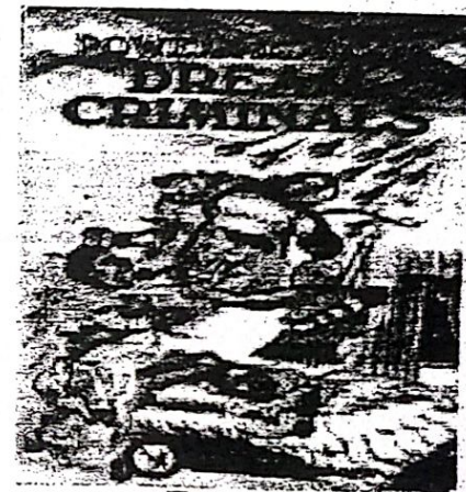
Figure 6: Deliverance. God's Medicine Bottle