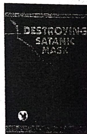
Figure 8: Destroying Satanic Mask