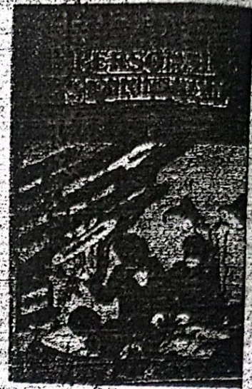
Figure 3: Personal Spiritual Check