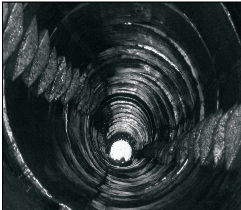
Figure 2: Well water vividly polluted with oil at one of the fuel stations.