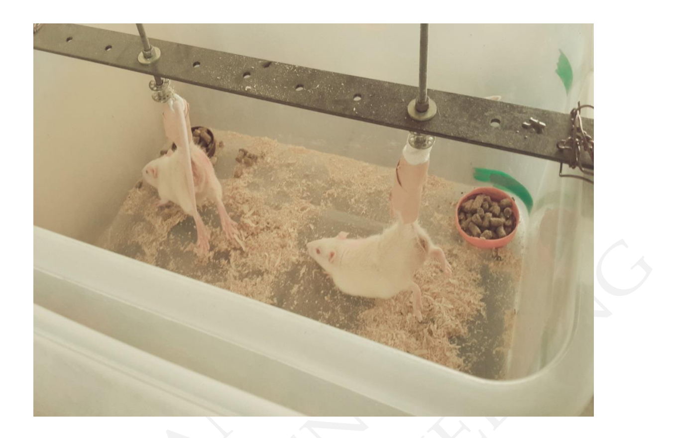
FIG .1 WISTAR RATS UNDERGOING SIMULATED MICROGRAVITY VIA HINDLIMB UNLOADING