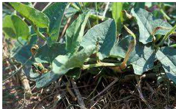
Fig. 1. A pictorial image of Aristolochia longa L.