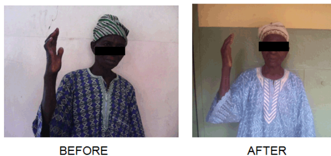
Figure 4: Preoperative and postoperative pictures of Case 4.

A 60-year-old security man presented with claw right hand of 27 years duration. He was diagnosed to have Hansen’s disease about 30 years ago and was treated with MDT for a year. There was no history of the disease in the family. On examination, he was found to have a claw hand resulting from ulnar nerve paralysis. The metacarpophalangeal, proximal and distal interphalangeal joints were mobile. Preoperative physiotherapy was done to strengthen the flexor digitorum superficialis muscle of the middle finger. He was operated using the same technique. The POP and the operation site sutures were removed after three weeks and he had post-operative physiotherapy for three weeks (Figure 4).