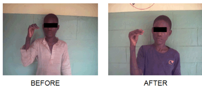
Figure 1: Preoperative and postoperative pictures of Case 1.