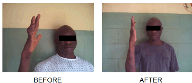
Figure 3: Preoperative and postoperative pictures of Case 3.