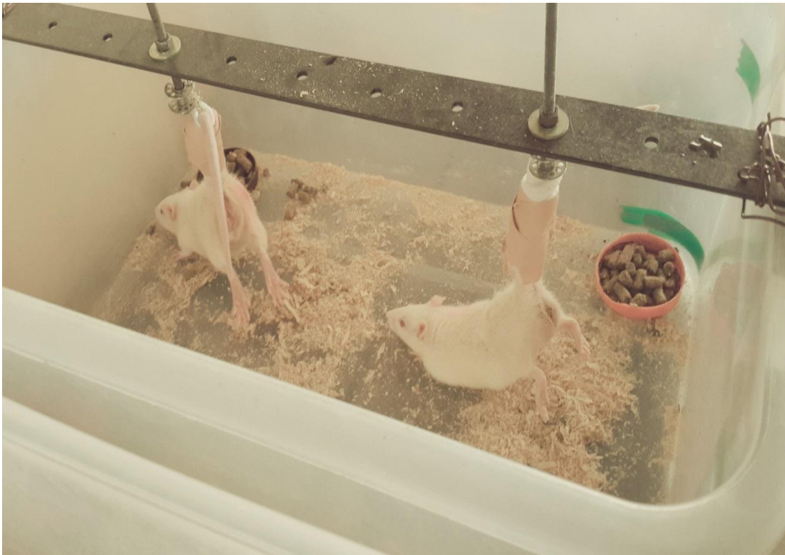
FIG .1 WISTAR RATS UNDERGOING SIMULATED MICROGRAVITY VIA HINDLIMB UNLOADING