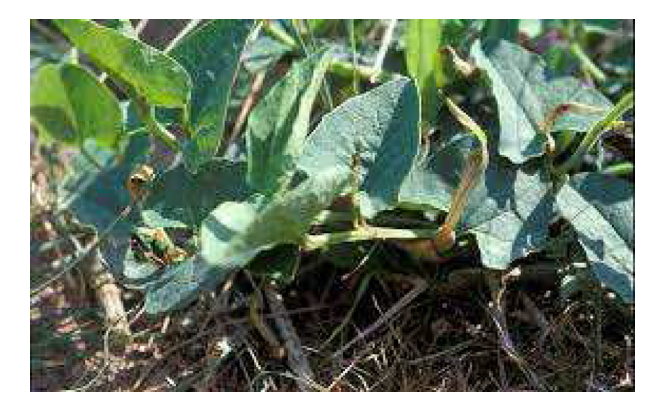
Fig. 1. A pictorial image of Aristolochia longa L.

As a keyword, the name of the plant, Aristolochia longa L., was used. Data for this review on A. longa L. was gathered from internationally recognized scientific databases via an electronic search (Wiley, SciFinder, Google Scholar, Springer, Web of Science, Francis & Taylor, Elsevier, PubMed, and The PlantList database). Furthermore, the medical books and PhD and MSc theses associated with A. longa , have been thoroughly examined and excerpts from them have been added to this review.