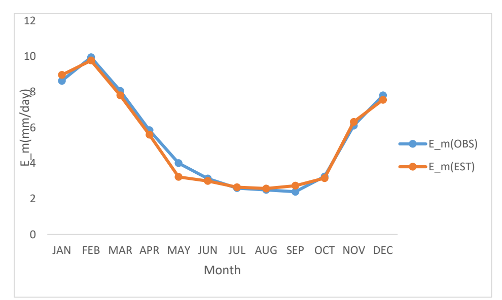
Fig. 1. Comparison of average estimated and observed evaporation in Ilorin